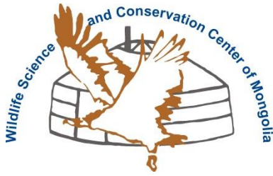
Wildlife Science and Conservation Center